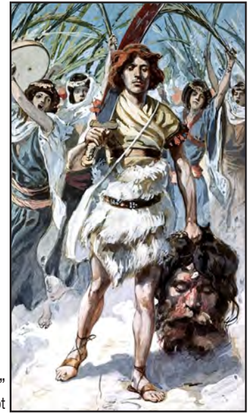
"David Takes the Head of Goliath to Jerusalem" by James Tissot