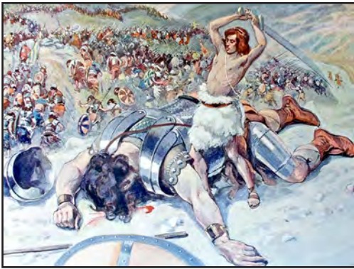
"David Cuts Off The Head of Goliath" by James Tissot