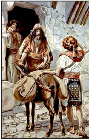
"David Takes Saul The Presents From Jesse" by James Tissot