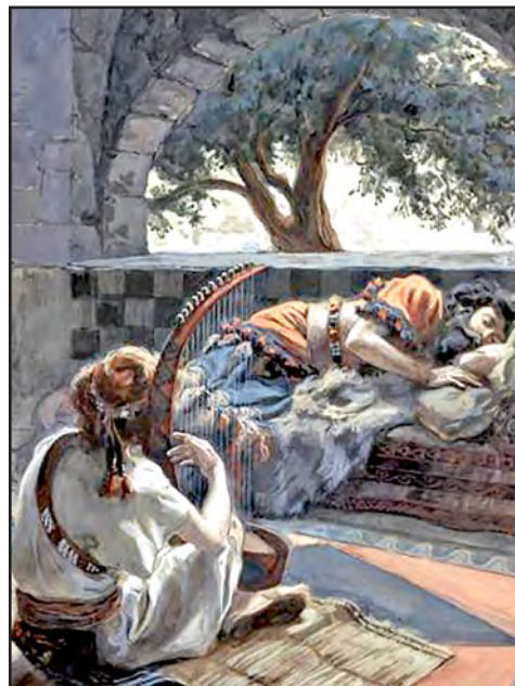
"David Plays The Harp Before Saul" by James Tissot