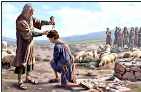
The anointing of David (artist unknown)

The Life Application Study Bible, ©2007 Tyndale House Publishers, Inc.