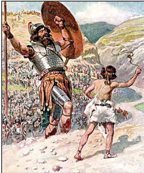
"David Slings the Stone" by James Tissot