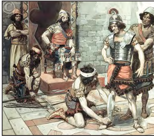
"Saul Puts His Armor Upon David" by James Tissot