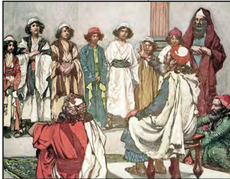
"Jesse Presents His Sons to Samuel" by James Tissot

The Life Application Study Bible, ©2007 Tyndale House Publishers, Inc.