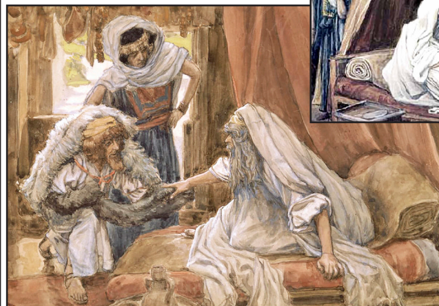
"Jacob Deceives Isaac" by James Tissot