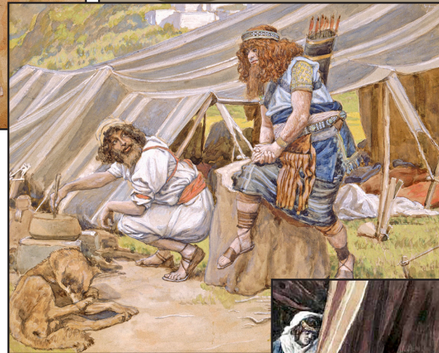
The NIV Quickview Bible