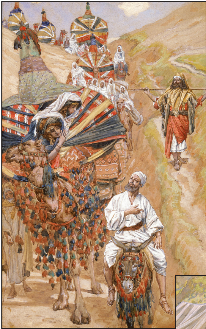
"Rebekah Meets Isaac By The Way" by James Tissot