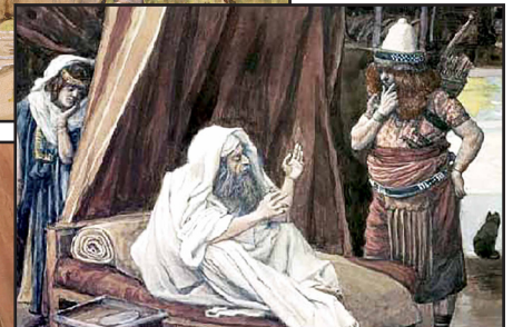
"Isaac Sends Esau To Hunt" by James Tissot