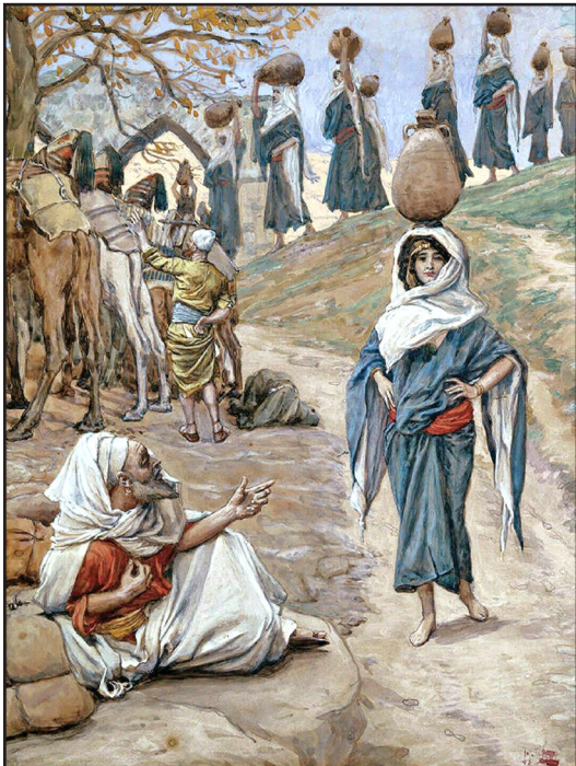
"Abraham's Servant Meets Rebekah" by James Tissot